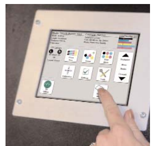
Easy and intuitive 7 inch /17.7 cm color touchscreen front panel