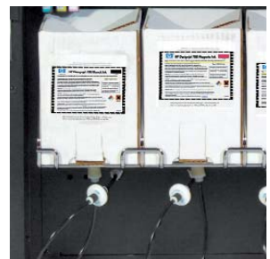
No-drip, quick connect/disconnect HP Designjet 788 inks