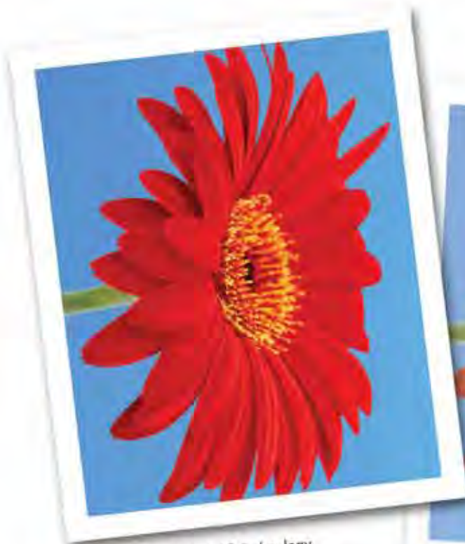
HP Papers with ColorLok® Technology