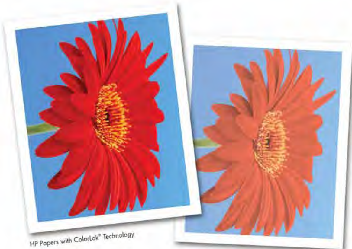
HP Papers with ColorLok® Technology