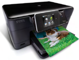
Photosmart Plus e-AiO

These products are AirPrint compatible with Apple iOS 4.2: 3,4