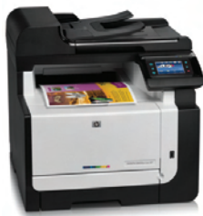
LaserJet Pro CM1415fn Color Multifunction Printer

These products require a firmware upgrade to be AirPrint compatible - available now: 3,4