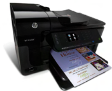
Officejet 6500A e-AiO

These products require a firmware upgrade to be AirPrint compatible - available now: 3,4