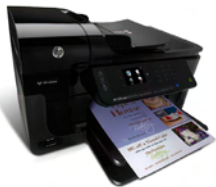
Officejet 6500A e-AiO

These products require a firmware upgrade to be AirPrint compatible - available now: 3,4