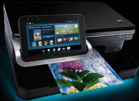
HP Photosmart eStation AiO

These products are AirPrint compatible with Apple iOS 4.2: 3,4