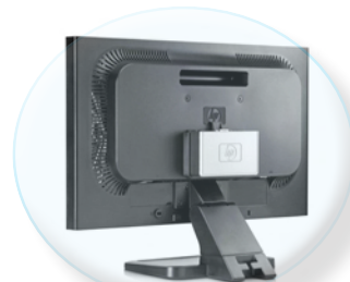
HP LE1851 wt Monitor with HP t150 mounted