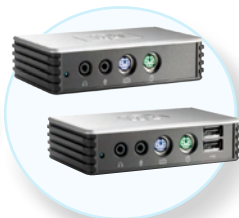
HP MultiSeat t100 or t150 Thin Client