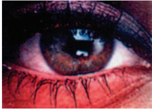
HP B1J 2800

HP's PQ shows more gradual skin tone and sharper image