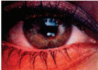
Canon B1J 2300

HP's PQ shows more gradual skin tone and sharper image