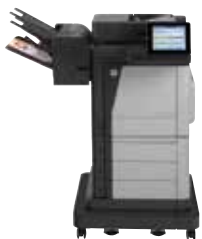
HP Color LaserJet Enterprise Flow MFP M680z