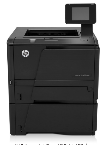
(HP LaserJet Pro 400 M401 dw with optional 500-sheet tray)