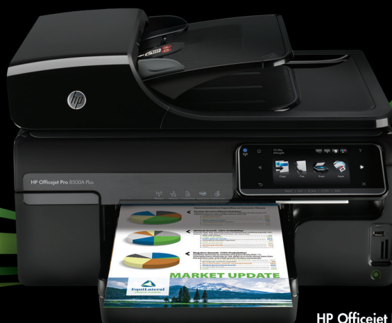
HP Officejet Pro 8500A Plus e-All-in-One

Reduce your environmental impact while you reduce costs.