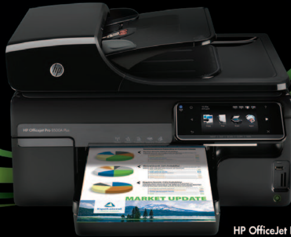
HP OfficeJet Pro 8500A Plus e-All-in-One

Reduce your environmental impact while you reduce costs.