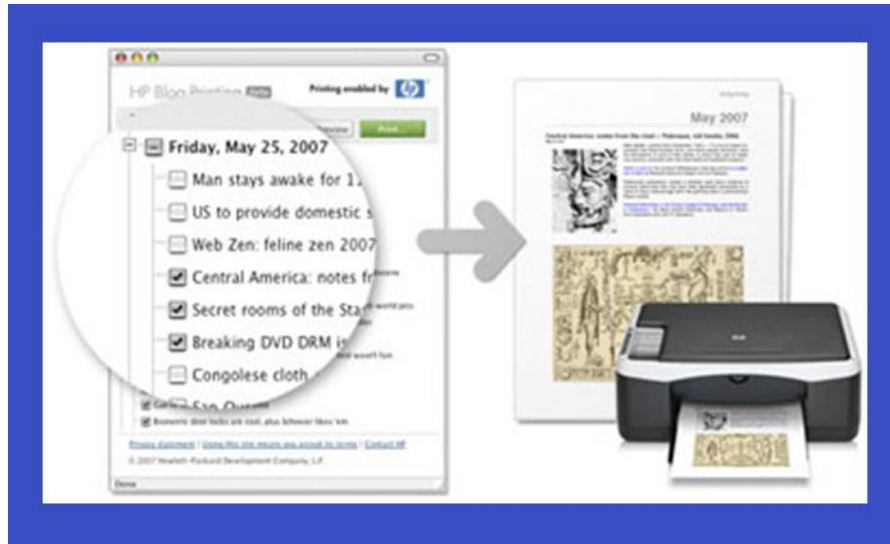
HP Blog Printing

HP Blog Printing makes it easy to add full-featured printing to your blog so users can enjoy a customized read on the go. Starting at the print button, readers can pick and choose the posts they want to print, free of sidebars, ads and other clutter. Each great-looking printout is fully formatted to reduce paper waste.