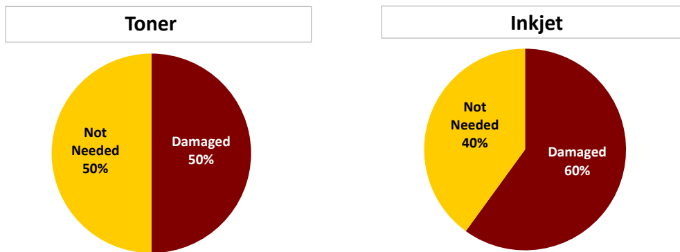
Figure 1: Distribution of Unusable Cartridges

For Latin America, toner cartridges are typically remanufactured 1 to 2 times, on average, but some respondents reported remanufacturing up to 3 to 4 times. Inkjet is also remanufactured 1 to 2 times, on average, but respondents said they had remanufactured up to 4 to 5 times.