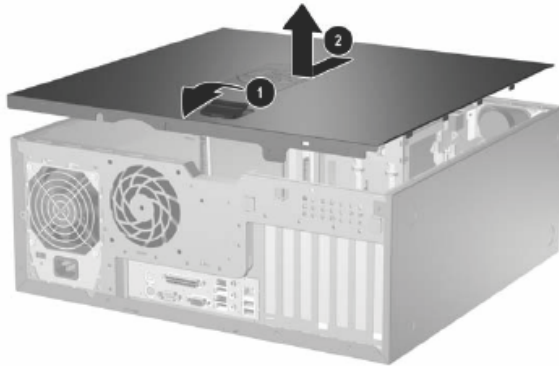
FIGURE 1: Removing the access panel