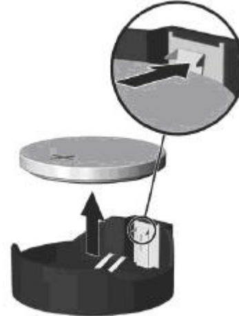
FIGURE 4: Type 2 battery holder