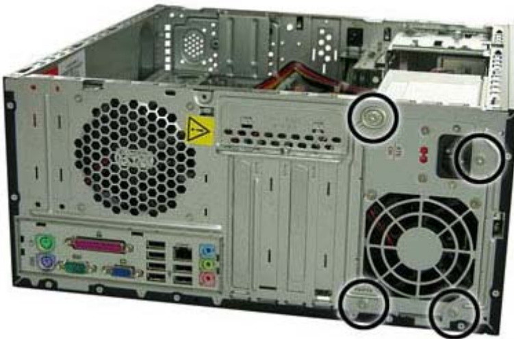
FIGURE 6: Power supply release tab location