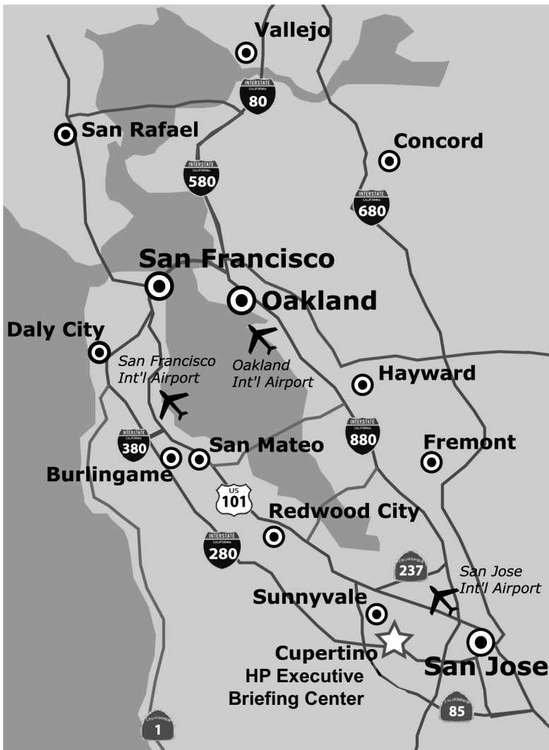
San Francisco Bay Area