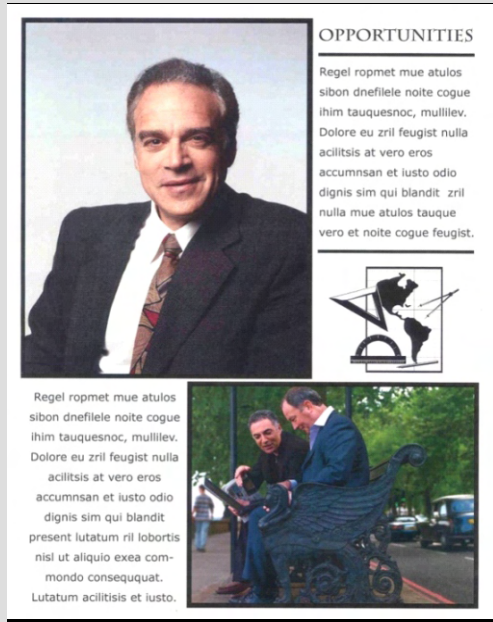
HP CLJ CP1510 output