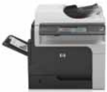
(HP LaserJet Enterprise M4555h MFP)