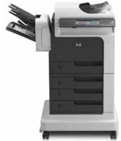
(HP LaserJet Enterprise M4555 MFP series)

Achieve versatile, powerful MFP performance for a more productive printing environment. Print and copy at high speeds, use image preview to process jobs from the HP Easy Select pivoting color control panel and get robust paper handling up to 2100 sheets. 1 Expand the functionality of imaging and printing devices with market-leading management and extensibility. This ENERGY STAR ® qualified MFP can help save on energy and paper, and advanced security features can help protect sensitive data.