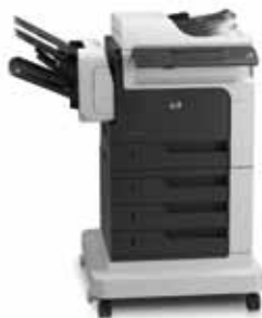
(HP LaserJet Enterprise M4555fskm MFP)