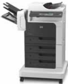
(HP LaserJet Enterprise M4555f MFP)